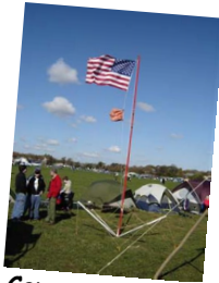
Camporee with 'floating' flagpole

GREAT! If you are a boy 10- 1/2 thru 18 you can join our troop! We are one of several excellent BSA troops in the Medford area - we'd like you to join ours if you feel comfortable and want to have fun!