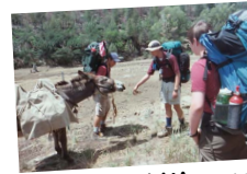
Philmont NM—our scouts 'persuade' a donkey to help out!

We hold weekly meetings where we work on 'advancement' thru the scout ranks, and plan our next event. "Be Prepared" is our motto, so we make sure we have the food, transportation, reservations and other items for a safe and fun environment. Some weeks we might go bowling, or swim at the local school. Other times we have a camporee, whitewater rafting or backpacking trip in the mountains.