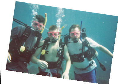
Troop 26 Seabase High Adventure Scuba Diving